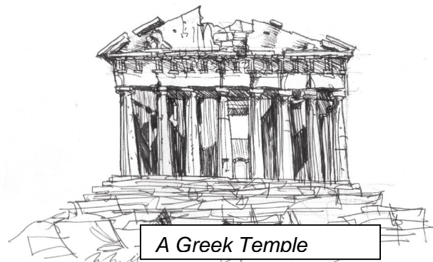
A Greek Temple

The Liturgy that we know today evolved over time. The earliest gatherings were small clandestine groups around the table of a house. As the Word spread, the Christians in Rome built underground gathering and burial areas known as the catacombs. Once Christianity was legalized, the Church came above ground and the House of the Church ( domus ecclesia ) came with them.