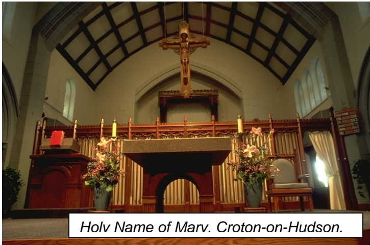
Holv Name of Marv. Croton-on-Hudson.

The Parish of Holy Name of Mary is a revivalist Romanesque church built in the early 20 th century in Croton-on-Hudson, New York. It had been designed to accommodate traditions that were over 1,000 years old. Here the challenge was to allow the interior architecture style to continue to dominate but adapt the floor plan to respond to the liturgical changes within existing walls. The added challenge was to rejuvenate the church without destroying the elements that endeared it to the parish. We appeared at numerous public sessions to explain the design changes and listen and convince them that we were not representatives of Satan sent to destroy their church.