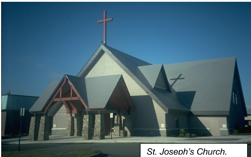
St. Joseph's Church.

The Parish of Saint Joseph in Spring Valley, New York, was building a new church to replace their small chapel and the school gymnasium that served them for over thirty years. Here we had the opportunity to rethink the floor plan for a post-Vatican II design. While the Parish would have appreciated any church that did not have a basketball net at each end, we saw the opportunity to create a traditionally inspiring aesthetic space within the limitations of modern technology.